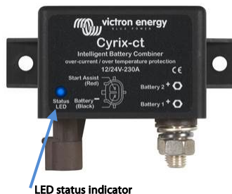
ED status indicator Cyrix-ct 12/24-230